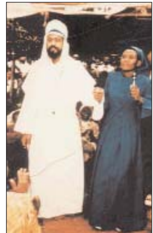
Maitreya as He appeared to 6,000 people in Nairobi, Kenya, 11 June 1988

Benjamin Creme regularly lectures worldwide, and appears on television and radio — in the USA alone he has been interviewed on more than 700 radio and television shows. He is author of 13 books — translated into 11 languages — and is editor of Share International magazine which circulates in 70 countries. He receives no payment for any of this work. Benjamin Creme offers a positive view of the future — a message of hope for the world.